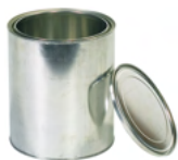
1 GALLON CAN

URETHANES AND POLYASPARTIS REQUIRE SPECIAL NITROGEN FILLED PACKAGING. THEREFORE, WE CAN ONLY PROVIDE MATERIAL IN THE FOLLOWING SIZES: