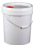
5 GALLON PAIL