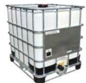
250 GALLON TOTE